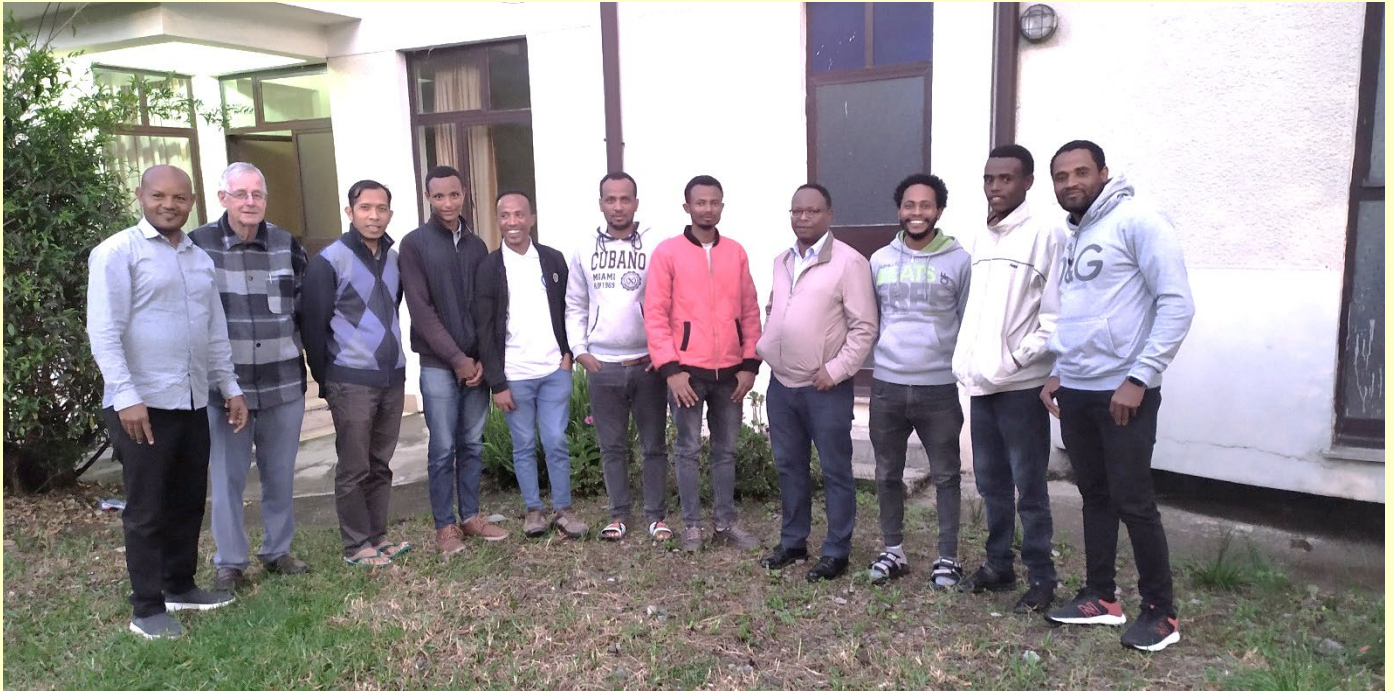
Pictured together in Addis Ababa: all the brothers side by side.

The Women Empowerment Centre focuses mainly on women, children and families in difficult circumstances. For example, you can think of single mothers, or mothers with disabled children without sufficient income. The situation of each of these persons is examined and together a course is mapped out that provides insight into better perspectives. The mothers for example receive training to start a small business in order to generate income. Employees regularly check the health of the women and children, and disabled children receive tailor-made education. After completing their trajectory, the participating women are once again resilient in their daily lives.