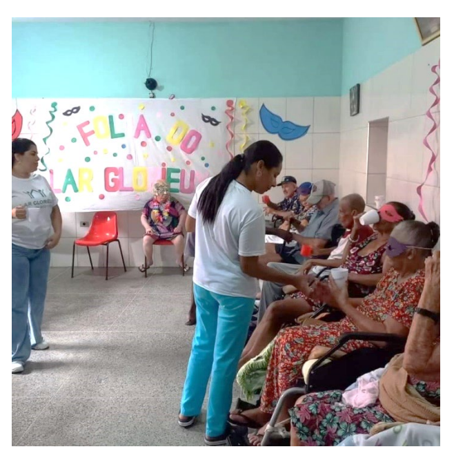
Folia do Lar Glorieux, freely translated, it's going to be really mad. Obviously, there is no age limit for having a ball!

This period also saw the fall of the carnival. February 11 was the Sunday of Carnival. In the social centre of Betim, the feast of Our Lady of Lourdes was therefore postponed by a week. The feast itself was celebrated on Sunday, and on the three preceding evenings there was a triduum. There was always a Eucharistic celebration in honour of Our Lady in preparation for the solemnity on 18 February, which was celebrated in the sports hall of the social centre. After the celebration there was time to eat and drink. The proceeds went to the social centre.