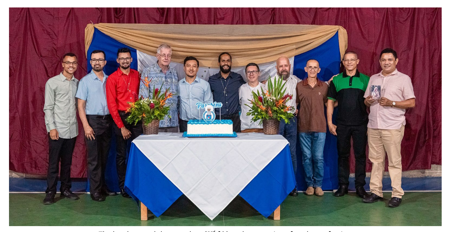
The brothers and the postulant ( 3^{rd} f.l.) at the reception after the profession.

This period also saw the fall of the carnival. February 11 was the Sunday of Carnival. In the social centre of Betim, the feast of Our Lady of Lourdes was therefore postponed by a week. The feast itself was celebrated on Sunday, and on the three preceding evenings there was a triduum. There was always a Eucharistic celebration in honour of Our Lady in preparation for the solemnity on 18 February, which was celebrated in the sports hall of the social centre. After the celebration there was time to eat and drink. The proceeds went to the social centre.