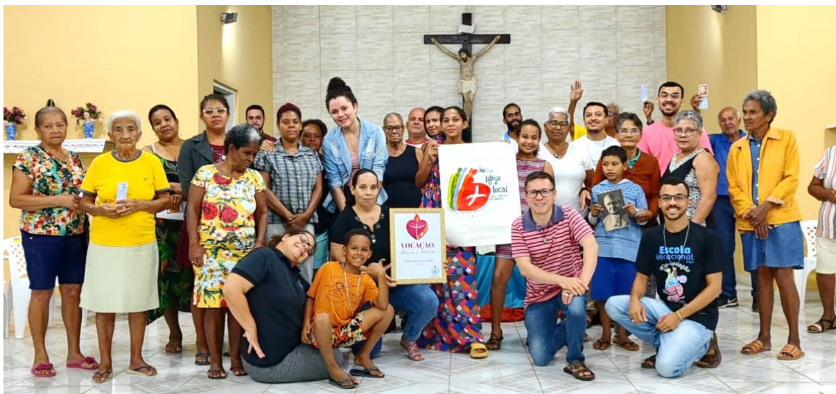
Mission in the Salto da Divisa Catholic Parish.

There were many experiences of a God present in the different realities of life, faces and attitudes of a group of people open to the other and full of hope. We found ourselves motivated and inspired to go along with God's People along the way.