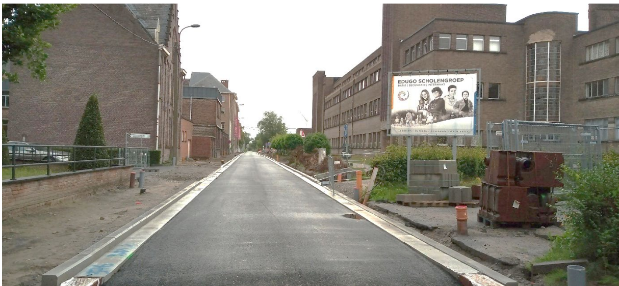
After years, the Sint-Jozefstraat will become a street without pits and without crumbling asphalt.

The works in the Sint-Jozefstraat have been halted for a few weeks due to the annual construction leave. In our humble opinion, the workers have earned their holiday because the first part of the road, from the parking lot of EDUGO to the Generalate, is already largely finished. The section from Onze-Lieve-Vrouwstraat to the Generaalat will soon be tackled, the footpaths will be reconstructed and a start will be made with the installation of street furniture.