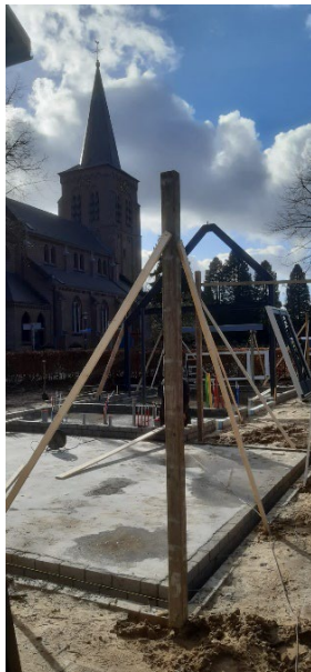
Vessem: the new construction starts with pouring a solid foundation.

In Vessem at the Pilgrims Hostel Cafarnaum , one of the outbuildings has been torn down; the contractor has started with the new construction. In the latter, there will be room for a bike storage, a toilet for invalids, facilities for elementary school pupils who pay a one-day pilgrim's visit, storage areas for, among others, garden tools, and a small workplace for upkeep.