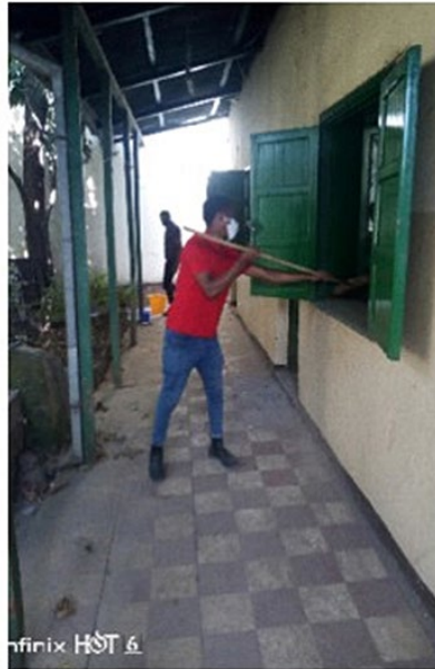
Preparing meals (l) Cleaning (r)