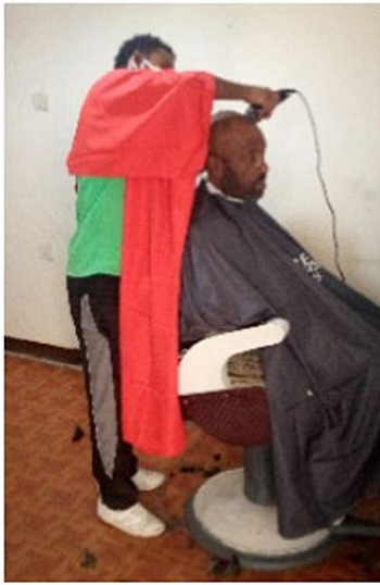
Activities in the Elderly People Project: Barber (l), Hygiene (r and below)