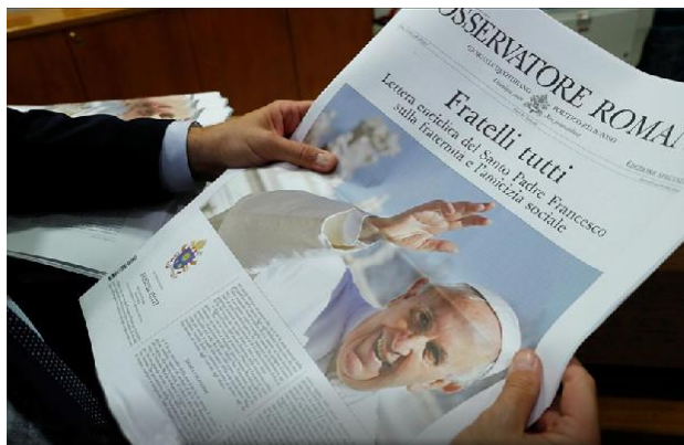
The Pope has chosen his name in honour of Saint Francis of Assisi, who was an apostle to the poor.

The Second Vatican Council generates a lot of renewal, also for religious, but simultaneously a lot of unrest and uncertainty. Our congregation was not an exception to this. In western countries there is an almost abrupt slowdown in new vocations.