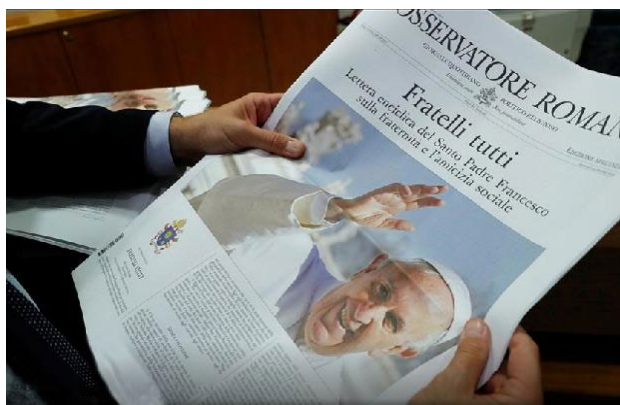
The Pope has chosen his name in honour of Saint Francis of Assisi, who was an apostle to the poor.

The Second Vatican Council generates a lot of renewal, also for religious, but simultaneously a lot of unrest and uncertainty. Our congregation was not an exception to this. In western countries there is an almost abrupt slowdown in new vocations.